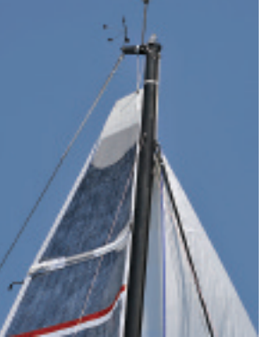
Top: fast in ORC in 2010, the Grand Soleil 42R Man which won the European title in Cagliari is a 2005 Botín & Carkeek IMS design. If there was not so much carbon involved the GS42R would make a good IRC racer... albeit with the bulb keel option. A contrast in IRC (left) versus ORC (right) headboard treatments - there is no IRC headboard measurement allowing a modern square profile but requiring a backstay flipper or a pair of running backstays